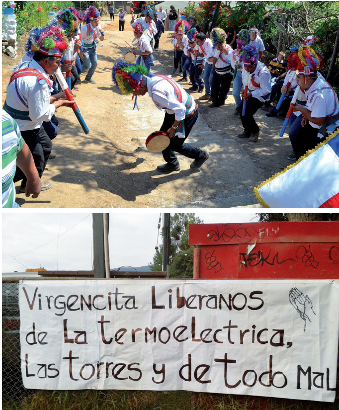
Figure 2 – Vernacular religious practices within and around La Campana-Peñuelas BR: a) Baile chino de Cai Cai in Limache; b) “Virgin save us from the thermal power station, the pylons and all evil”.

statue of the Christ child housed in the little church in Las Palmas. The pilgrimage route to las Palmas crosses the NP, creating another type of connection with nature through the pilgrimage under the sclerophyllous forests. This pilgrimage recalls one that no longer exists – the procession organized by the Congregation of the Sacred Heart at the end of the 19 th century. The old pilgrimage route passes under ancient belloto forests ( Beilschmiedia miersii ), opening the imagination to a very deep connection with the natural environment.